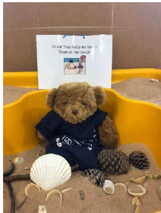
Sand Tray 😊